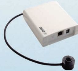
DF Series Features a Full HD Pinhole IP Camera (3.7mm - ZN1-V4FN4 or 2.8mm ZN1-V4FN4)