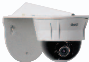
Wall Mount (Model ZC6-WM1)