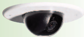
Flush Mount (Model) ZC-FM2