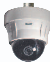
Pendant Mount (Model ZC6-PM2)