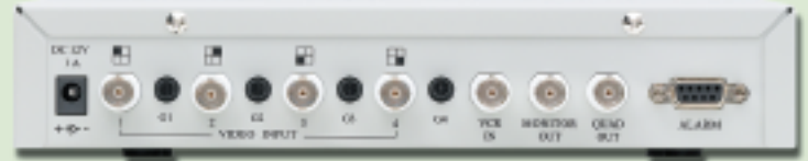
QD-04E Rear Panel