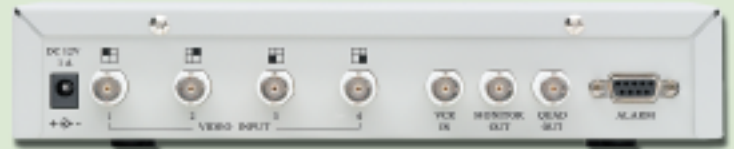
QD-04N Rear Panel