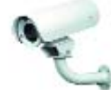
Pro-Pak Series Pre-installed Outdoor Camera Kits