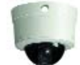
ZC-OH2 Housings Outdoor Dome Kits