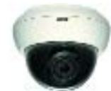
ZC-D3000 Series Hi-Res B/W or Color Domes