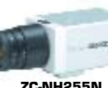
ZC-NH255N Hi-Res Mechanical Day/Night Camera