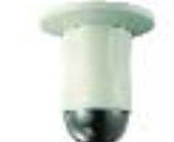
ZC-S120N Series 22x & 23x PTZ Domes