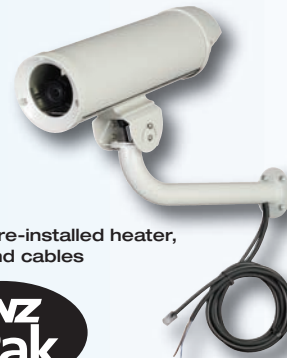
Available with pre-installed heater, camera, lens and cables