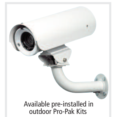
Available pre-installed in outdoor Pro-Pak Kits