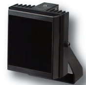
Optional IR Light IRL Series