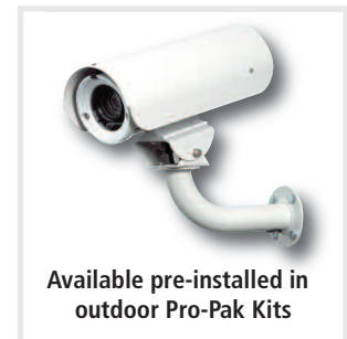
Available pre-installed in outdoor Pro-Pak Kits