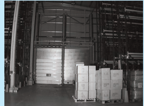
Warehouse With IR Illumination