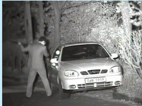
Car Theft With IR Illumination