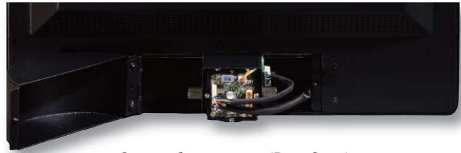
Camera Compartment (Door Open)